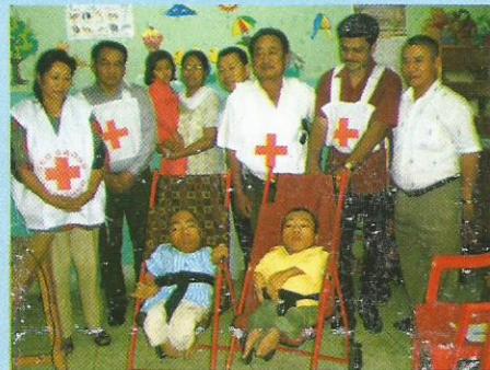
ICRC donating wheel chairs to PWDs