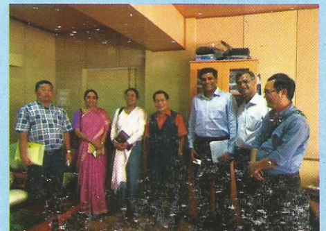
NIMH Officials at Chief Secretary office with CBS Members