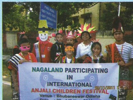
CBS Children at Odisha