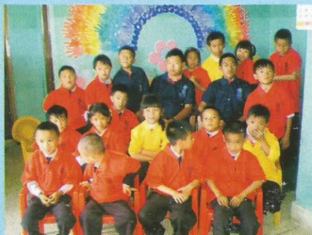
Special Children at CBS