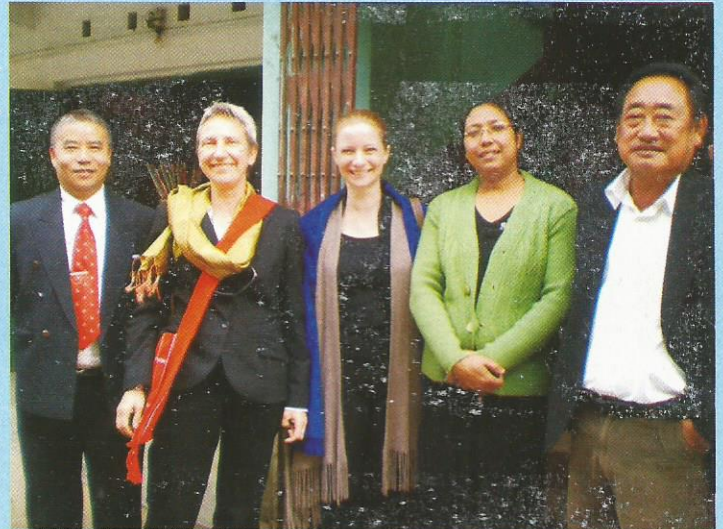
ICRC - Geneva Official with Secretary Red Cross Nagaland Branch at Cherry Blossoms Society

Participating in National and State level programs and competitions are encouraged to have all round development, as the slogan goes- "Say Yes To All Children".