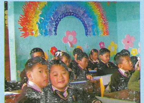
Special Children in the Classroom